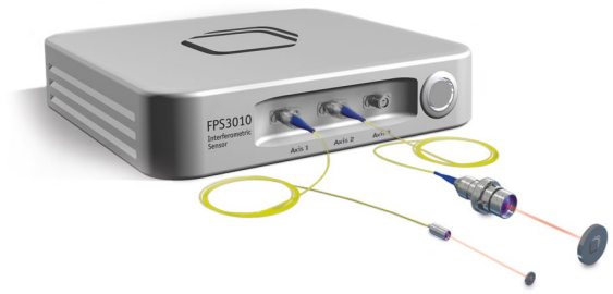
Figure 1: The real-time displacement FPS3010 sensor equipped with 3 channels using single mode fibers and compact sensor units.

In the controller, the signal is split into a low pass filtered direct signal and a 90^\circ phase shifted demodulated signal, enabling quadrature detection for the amount of movement and its direction. These signals are visualized by an application running on standard PCs and iPads, yet can also be routed through real time AquadB and high-speed serial outputs (HSSL), enabling higher OEM integration. For the measurement of the membrane's frequency response, a swept sine wave signal was applied to the membrane covering the full frequency range of 10 Hz to 20 kHz and the displacement was recorded in a sampling frequency of 44.1 kHz. The maximum displacement amplitude of the membrane was about 10 \mu\text{m} in the resonance peaks (at roughly 550 and 700 Hz). By Fourier-transforming the resulting time-dependent signal, one obtains the normalized frequency response as shown in Figure 3. A double peak structure can be seen that may arise from a beating effect of two resonances in the system, as well as a drop in amplitude at about 1500 Hz.